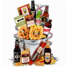
This image is the trademark of the author and is licensed under CC BY-NC-ND