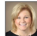
Sondra Odom Pearl Public School District